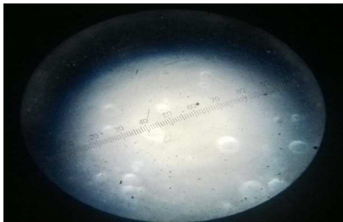
Figure No.1: Optical microscopic image of DS loaded microspheres